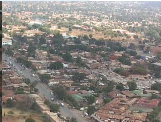
An aerial view of Moshi, as taken by our media partner.