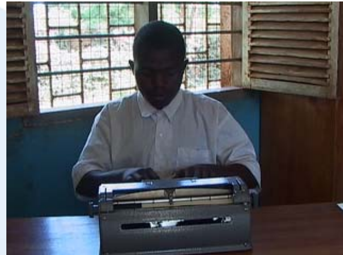
A blind student shows the use of a special computer for the Blind